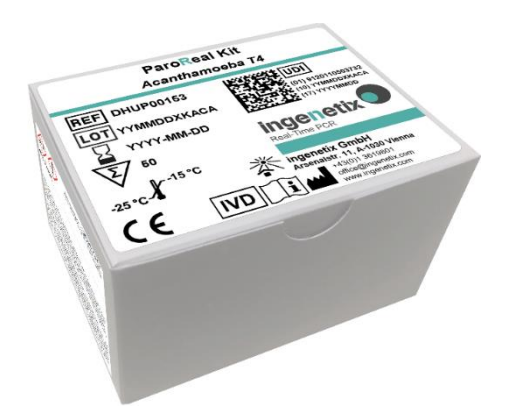
For in vitro diagnostic use only ParoReal® Kit Acanthamoeba T4 Order no. Reactions Pathogen Internal positive control DHUP00153 50 FAM channel Cy5 channel